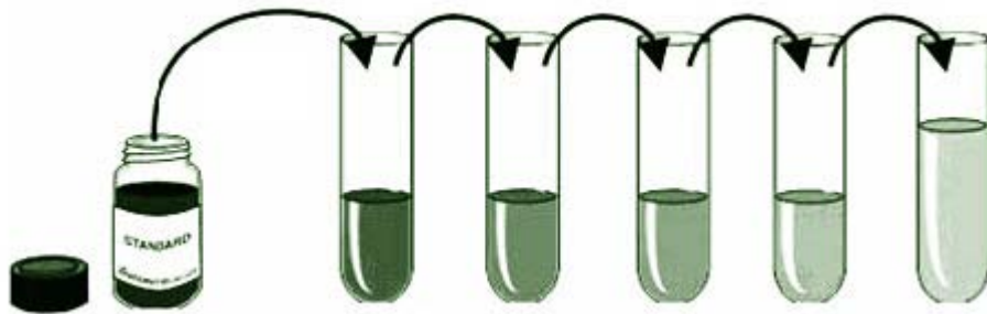
1280ng/L 640ng/L 320ng/L 160ng/L 80ng/L 40ng/L

2.The number of stripes needed is determined by that of samples to be tested added by that of standards. It is suggested that each standard solution and each blank well should be arranged with three or more wells as much as possible.